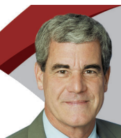
NASO Founder & President